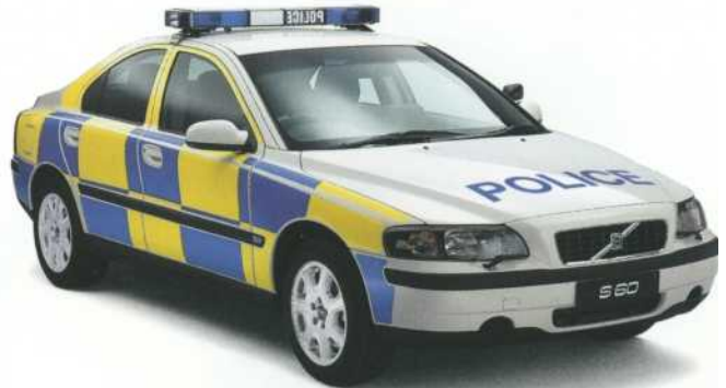
VOLVO S60 POLICE CAR Front-wheel drive. Alternative engines: five-cylinder 250-bhp turbo petrol engine or a five-cylinder 163-bhp direct-injection turbodiesel. Five-speed manual gearbox or five-speed adaptive automatic transmission (not available with the diesel engine). Sport chassis with DSTC anti-skid system and automatic height control.