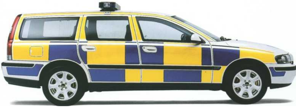
VOLVO V70 POLICE CAR Front-wheel drive. Alternative engines: five-cylinder 250-bhp turbo petrol engine or a five-cylinder 163-bhp direct-injection turbodiesel. Five-speed manual gearbox or five-speed adaptive automatic transmission (not available with the diesel engine). Reinforced police-specification chassis with DSTC anti-skid system and automatic height control.

The Volvo cars have what it takes to make a world-class police car with superior crash safety, dynamic ride and road holding with high levels of comfort.