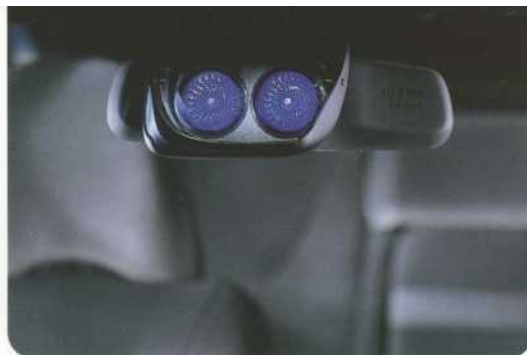
BLUE FLASHING LAMPS IN WINDSCREEN (Option)