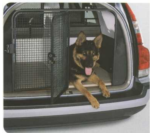
DOG COMPARTMENT Divided into two sections, with excellent ventilation. The compartments are designed with consideration for the dogs' safety and comfort. The dogs can be released either to the rear or via electrically operated hatches forward onto the rear seat. The durable interior trim is easy to keep clean. (Optional for the Volvo V70 and Cross Country.)