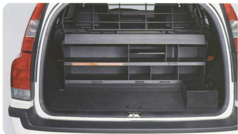
STORAGE SYSTEM The storage system is easily modified to suit varying needs. (Option)