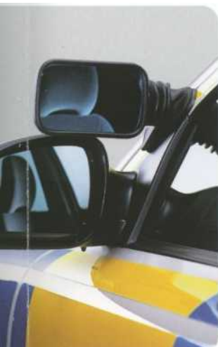
ADDITIONAL EXTERNAL REAR VIEW MIRROR (Option)