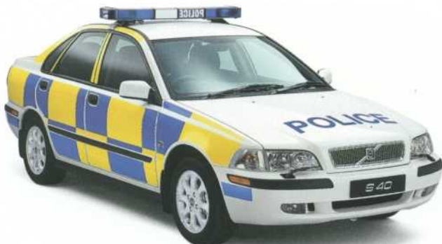
VOLVO S40 AND V40 POLICE CAR Front-wheel drive. Alternative engines: four-cylinder 136-bhp petrol engine, turbocharged 165-bhp or 200-bhp petrol engines or a 115-bhp direct-injection turbodiesel. Five-speed manual gearbox or five-speed adaptive automatic transmission. Chassis with DSA anti-skid system and automatic height control.