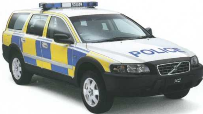
VOLVO CROSS COUNTRY POLICE CAR Four-wheel drive (AWD/TRACS) and greater ground clearance. Five-cylinder 200-bhp turbo petrol engine. Five-speed manual gearbox or five-speed adaptive automatic transmission. Automatic height control.

The Volvo Police cars are individually tailored at the Volvo Car Special Vehicles' workshop in Goteborg ready for final commissioning in the UK according to the customer's build specification.