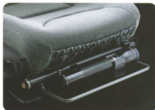
HOLDER FOR BATON AND FLASHLIGHT The baton and flashlight holder is reached no matter how much the seat is adjusted fore-aft. (Option)