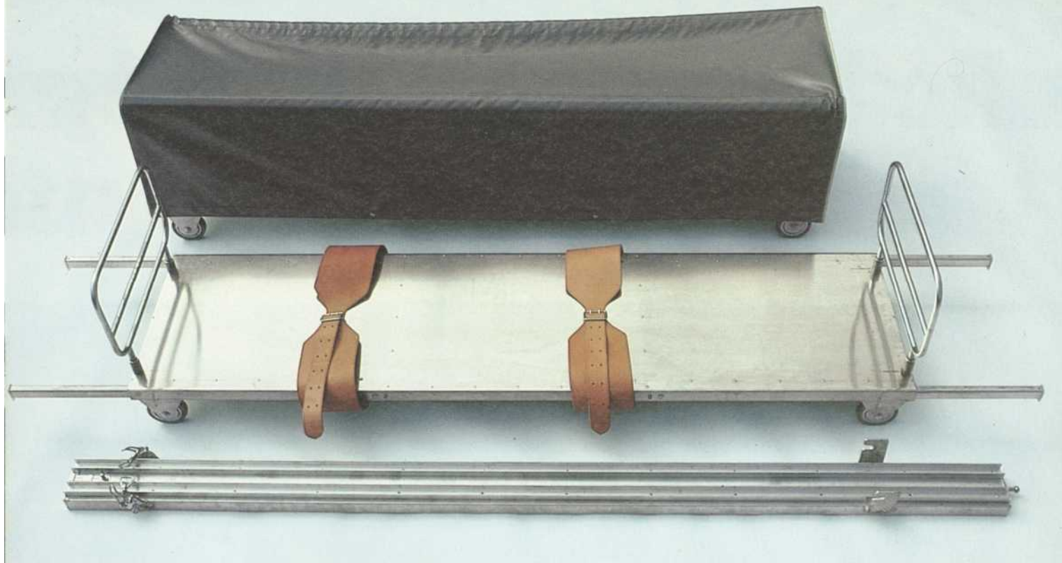
The Volvo 245 Hearse can carry two special wheeled stretchers at the same time. The special stretchers can be ordered separately, with or without covers.